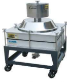
High Efficiency Particulate Absorbing Filter HEPA(0.3µm)